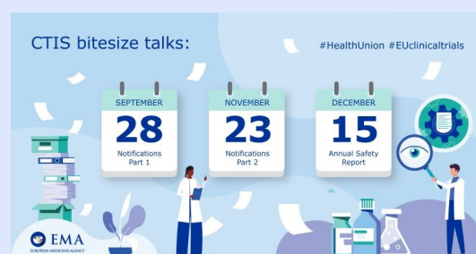
Image 2. CTIS bitesize talks continue for 2022 View and share in LinkedIn

All 2022 video recordings are already published in the respective event pages for February , March , April , May , June , July and September .